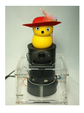
Figure 1: Keepon Robot

The robot platform chosen for this study is Keepon, a nonmobile platform with four degrees of freedom, designed to interact with children [15]. We are using a version of the My